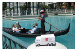
Foamy is at the Venetian in Las Vegas